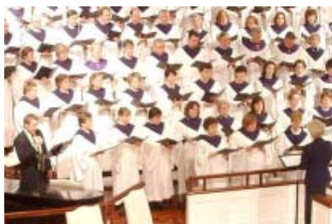
“Excellent choir. Worshipful and uplifting.”