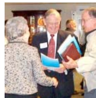
“My overall impression? The best yet! Keep it up!”