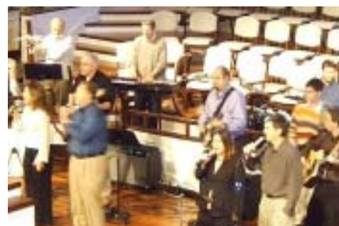
“It was good to be exposed to new worship experiences. I hope you continue to offer new worship opportunities.”