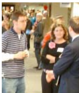
“The GA is so important for fellowship & for keeping the focus on our mission”