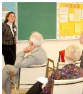
“Very informative, interesting, helpful, enriching, meaningful personally.”