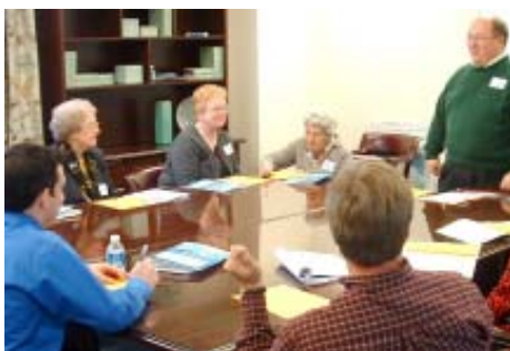
“Each of the workshops was particularly on target for me and my needs.”