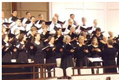
“Thank you for incorporating the Baptist Fellowship Choir of NC. They were wonderful.”