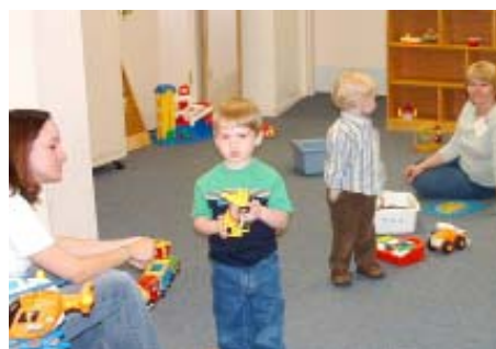
“Childcare is the no. 1 factor in my attending the CBFNC conference. This year’s childcare was excellent.”