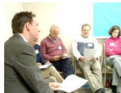
“A great deal of information, insight & inspiration was gained from each and all sessions.”