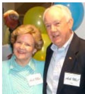
“I have never experienced such helpfulness on the part of a host church!”